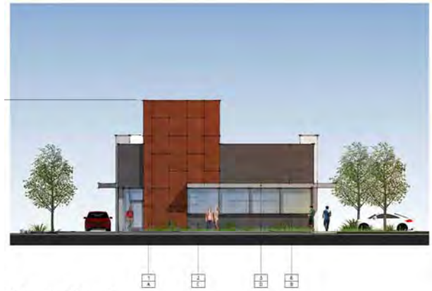
South Elevation (view from Kendall Road)