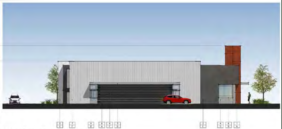
West Elevation (view from Broad Street)