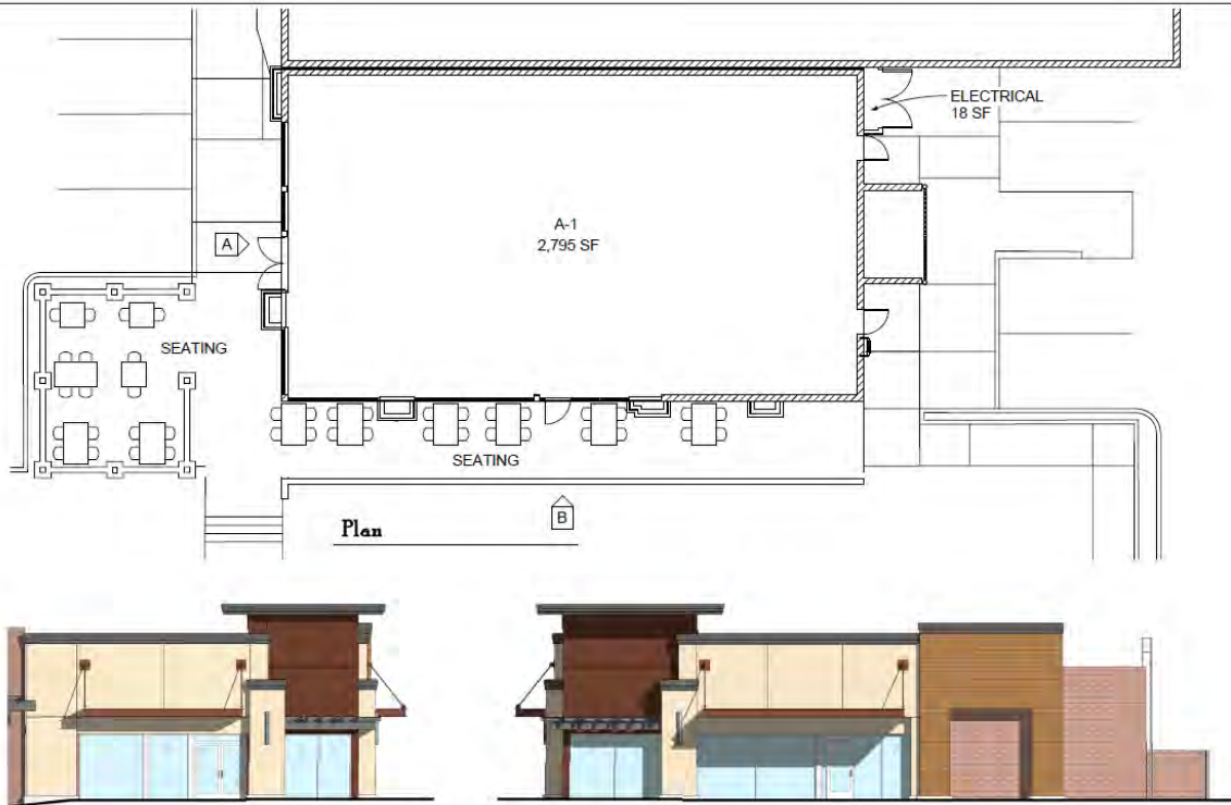
A East Elevation